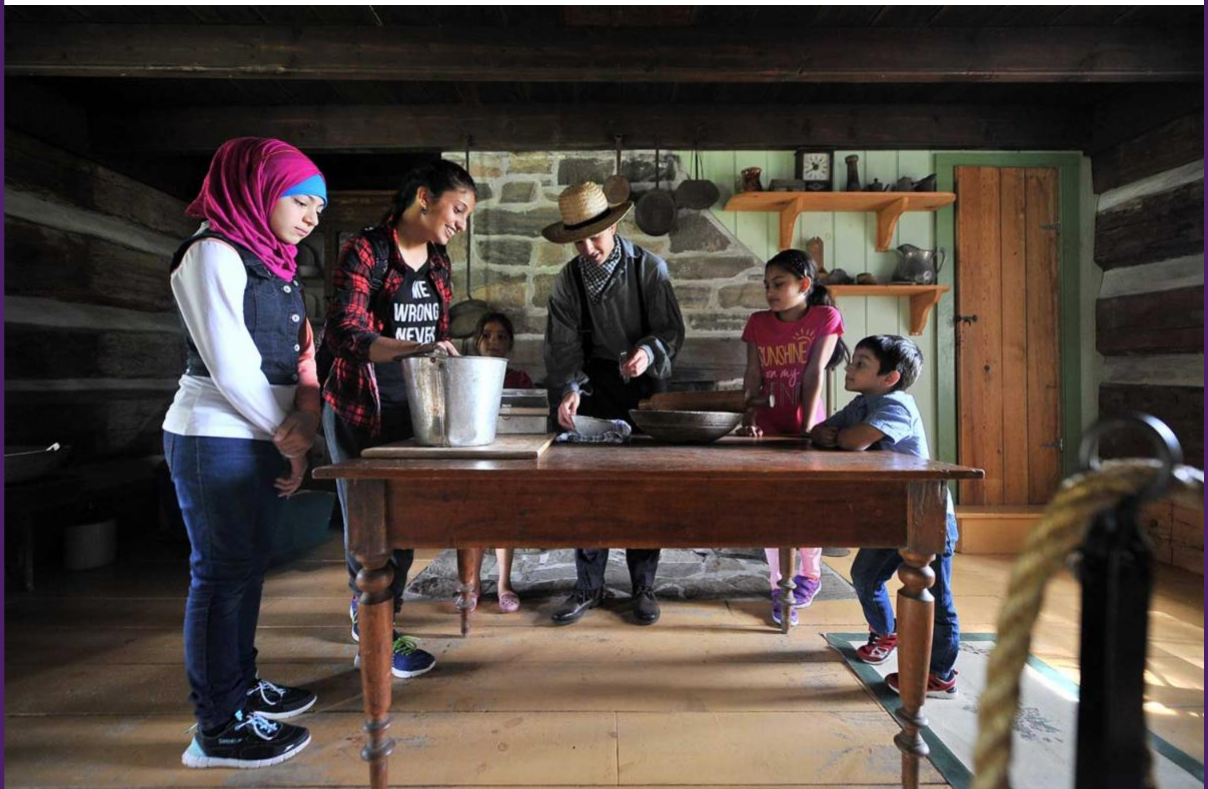
Intérieur du Musée du comté de Simcoe