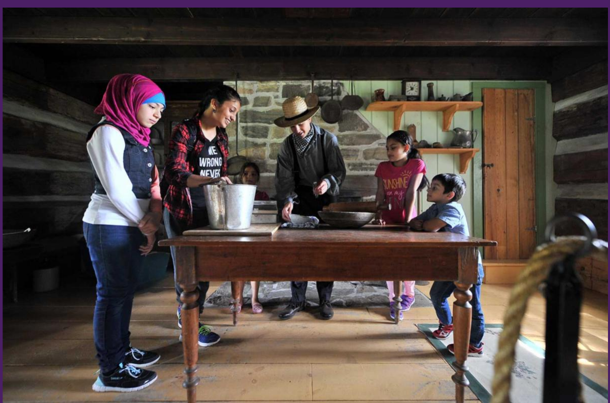
Inside the Simcoe County Museum

From: Ontario Heritage Trust | Fiducie du patrimoine ontarien <marketing@heritagetrust.on.ca> Sent: January 17, 2025 10:07 AM To: Conmee Clerk Subject: Reminder: REMINDER: Register today for Doors Open Ontario 2025 and SAVE! | RAPPEL : Inscrivez-vous dès aujourd'hui à Portes ouvertes Ontario 2025 et ÉCONOMISEZ!